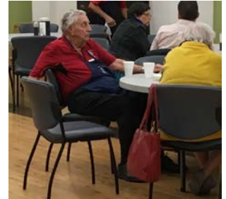
Knight hard at work